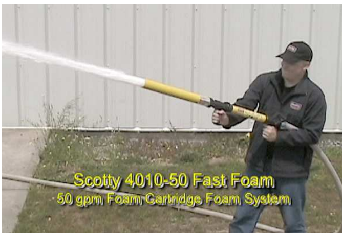
Scotty 4010-50 Fast Foam 50 gpm Foam Cartridge Foam System

Each unit comes with six foam cartridges! Each foam cartridge lasts up to 30 minutes! Suggested List of $298 USD!