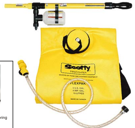
4000F-BP, Foam Hand Pump & 5 Gallon Backpack

Photo above shows detail of vacuum relief valve for foam bottle. The vacuum relief valve knob does not change the concentration of foam, it only keeps the foam bottle from collapsing as the foam is drawn from it.