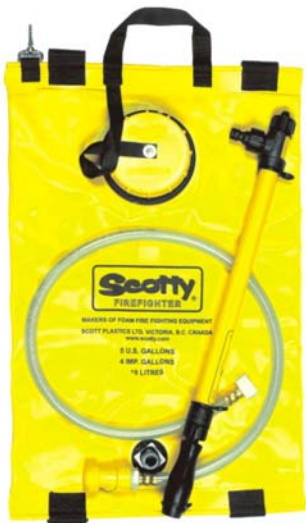
Photo at Left shows a 4000-BP, Hand Pump & 5 Gallon Back Pack