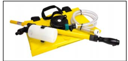
Photo above shows a 4000F-BP, Foam Hand Pump & 5 Gallon Backpack

The diagram and photo below can be used as a reference when cleaning or repair/replacement parts are required