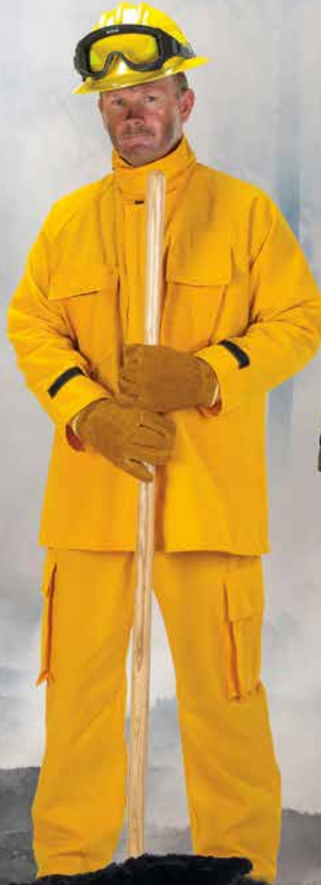
6 oz. Nomex®