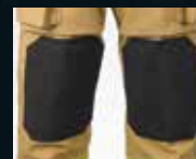
Knee Expansion Pleats