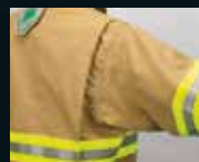
Pleated Back gives freedom of movement

Compliant to the new 2013 Edition NFPA 1971