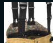
Black-Ops™ Multi-Adjust Suspender System