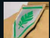
"Easy Grip" Drag Rescue Device