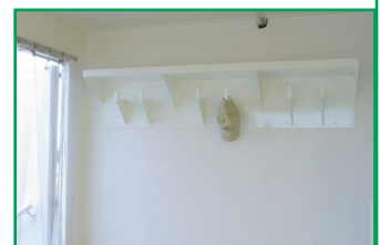
Turnout Gear Rack