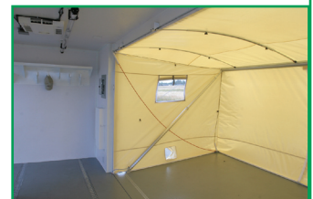
Expanded Cabana Wing

Nor E First Response, Inc. 3890 Hammer Drive Bellingham, WA 98226 U.S.A. Toll Free: 1.866.380.8455 Tel: 360.738.6467 Fax: 360.378.8043 Email: sales@nor-e.com