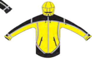
COLORWAY 4 HIGH VIZ YELLOW / BLACK