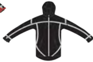
COLORWAY 2 BLACK / BLACK