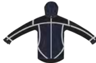
COLORWAY 3 BLUE / BLACK