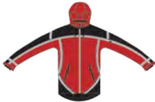
COLORWAY 1 RED / BLACK